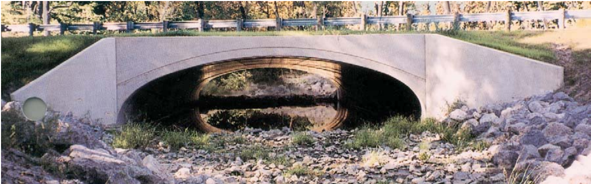
Figure 1.8: CON/SPAN Single Cell Precast Arch Culvert