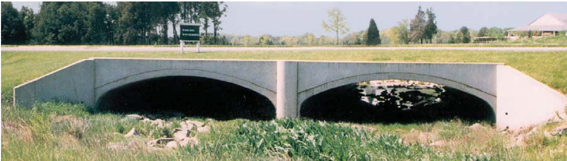
Figure 1.9: CON/SPAN Double Cell Precast Arch Culvert