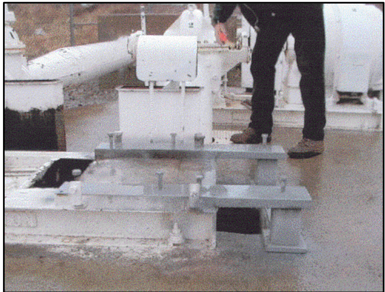
Figure 3. Motor Stand Modifications at Roza I.D. (Photo courtesy of Roza I.D.).

based on the fluctuations in the system, which proved difficult. The pump has a static lift of 139 feet and by using the MagnaDrive coupler, could be responsive to the demand. Modifications to the motor stand (Figure 3), motor shaft, and babbit bearings were necessary for the installation of the MagnaDrive coupler. The primary reason for the modifications was due to the fact that the setup was over 50 years old.