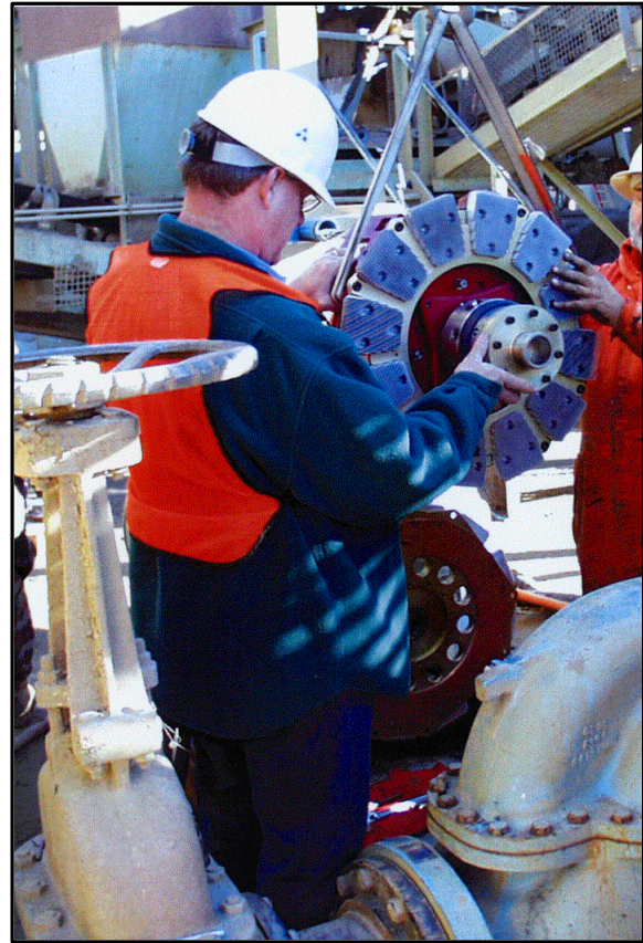
Figure 4. MagnaDrive Installation at Teichert Aggregates.

6 hours (Figure 4). This amount of time was necessary because, upon dismantling the pump, the crew discovered that the impeller was very badly worn and needed to be replaced.