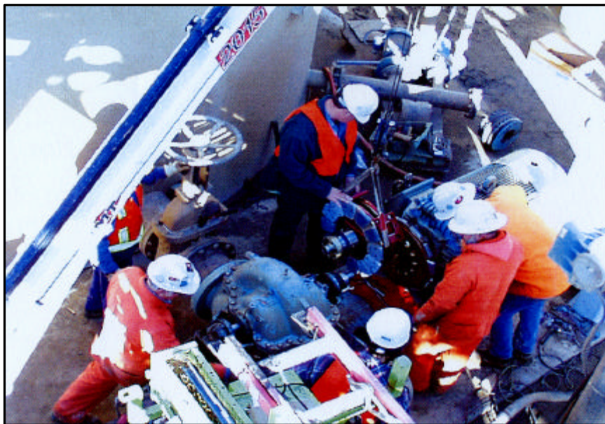
Figure 2. MagnaDrive Installation

The Irrigation Training and Research Center (ITRC) at California Polytechnic State University located the MagnaDrive at three locations as described in Table 1. A 50 HP vertical centrifugal pump is used at the Oxnard Wastewater Treatment Plant in Oxnard, a 150 HP horizontal centrifugal