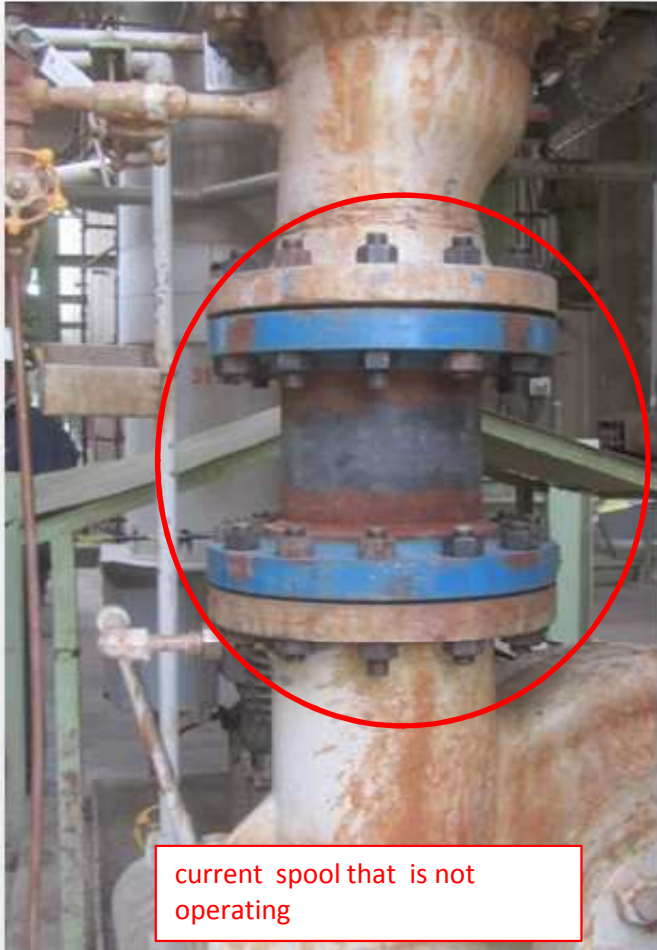
current spool that is not operating