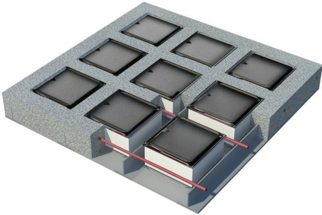
Glass-blocks held in a concrete matrix. Steel bars welded to ribs.