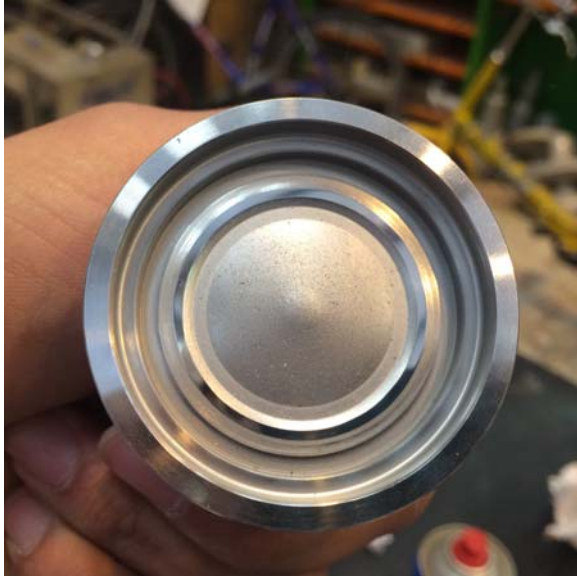
The damaged disc