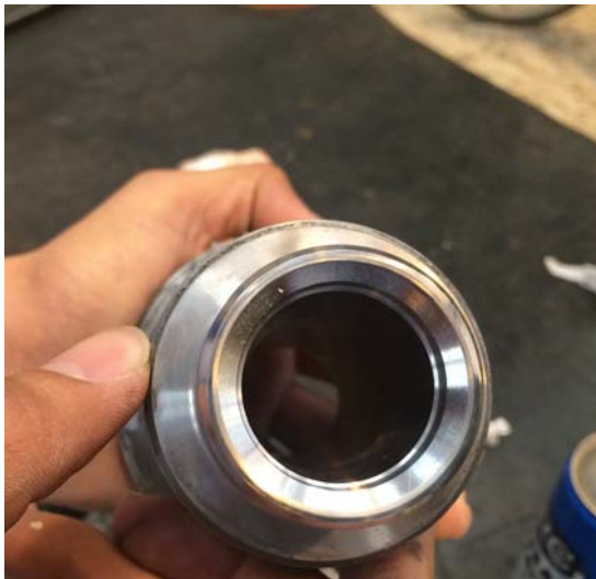
The damaged Nozzle