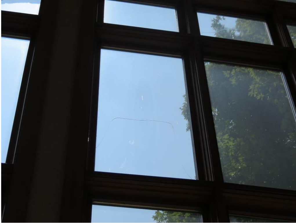
Photograph 3: Interior view of horizontal crack in window pane.