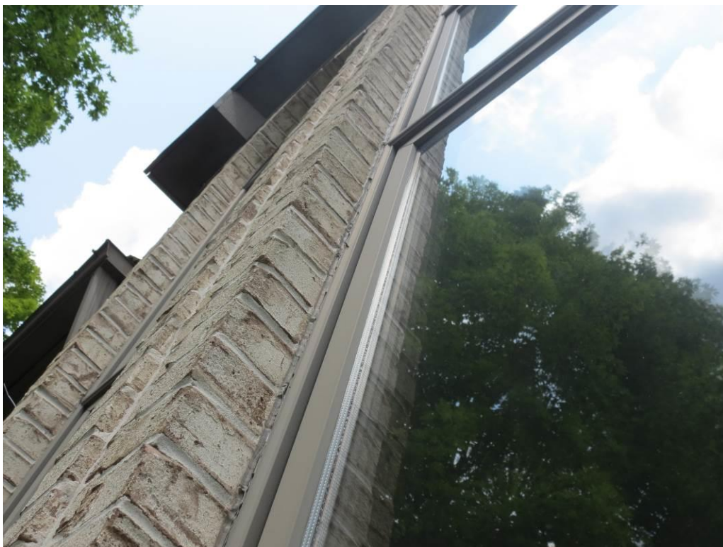
Photograph 5: No apparent separation between window frame and brick veneer.