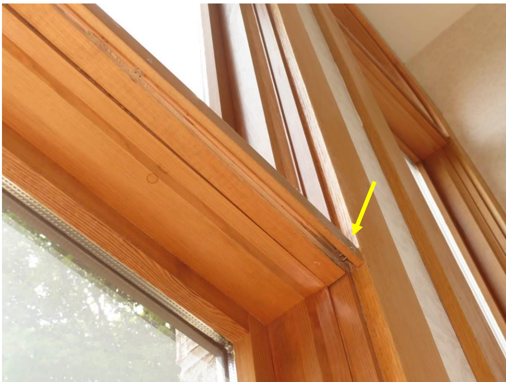
Photograph 11: Staple pop (indicated).