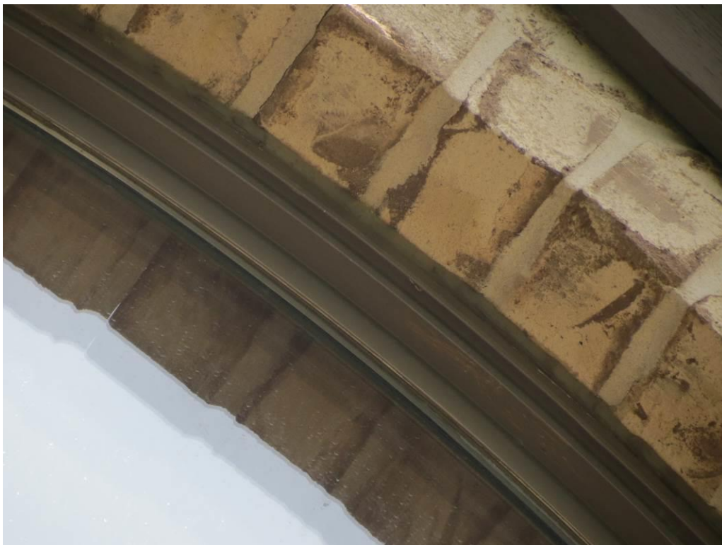
Photograph 8: No apparent movement between top of window and bottom of rowlock coursing above window.