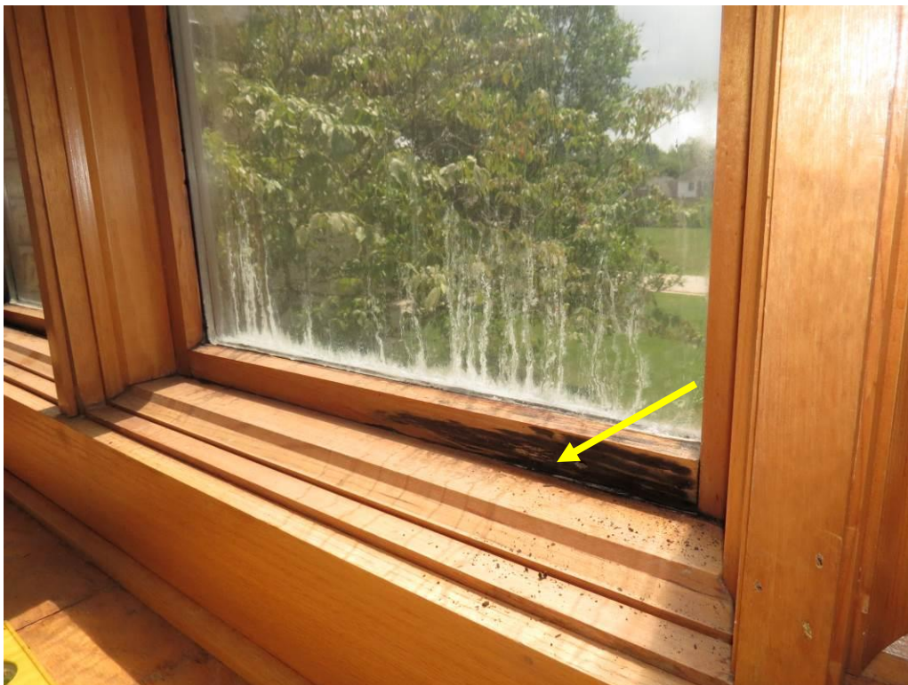
Photograph 10: Condensation build up. Black staining in area of wood rot (yellow arrow).