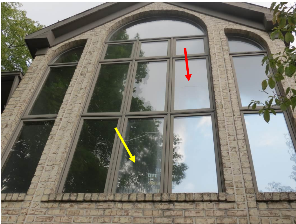
Photograph 2: Horizontal crack in window pane (indicated by red arrow). Heavy condensation build up between panes is indicated by yellow arrow.