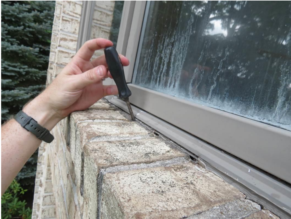
Photograph 7: Gaps between brick sill and window.