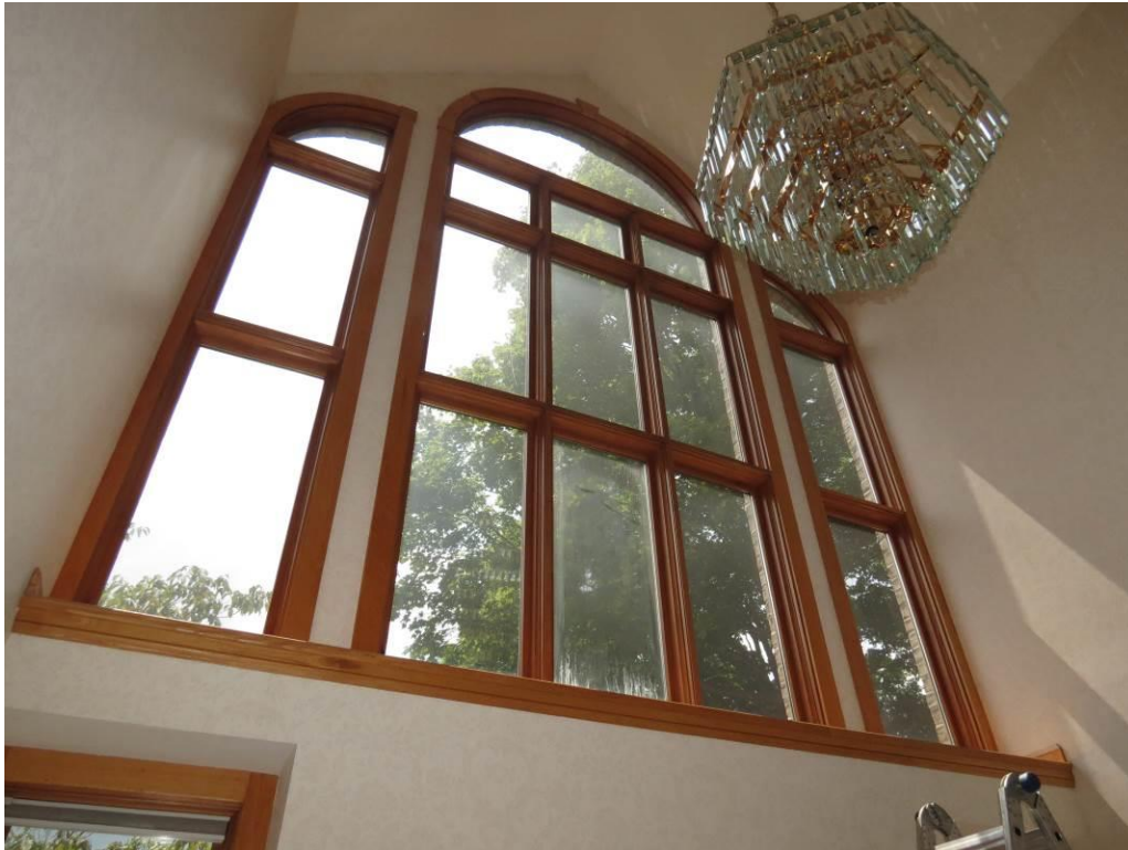
Photograph 9: Interior view.