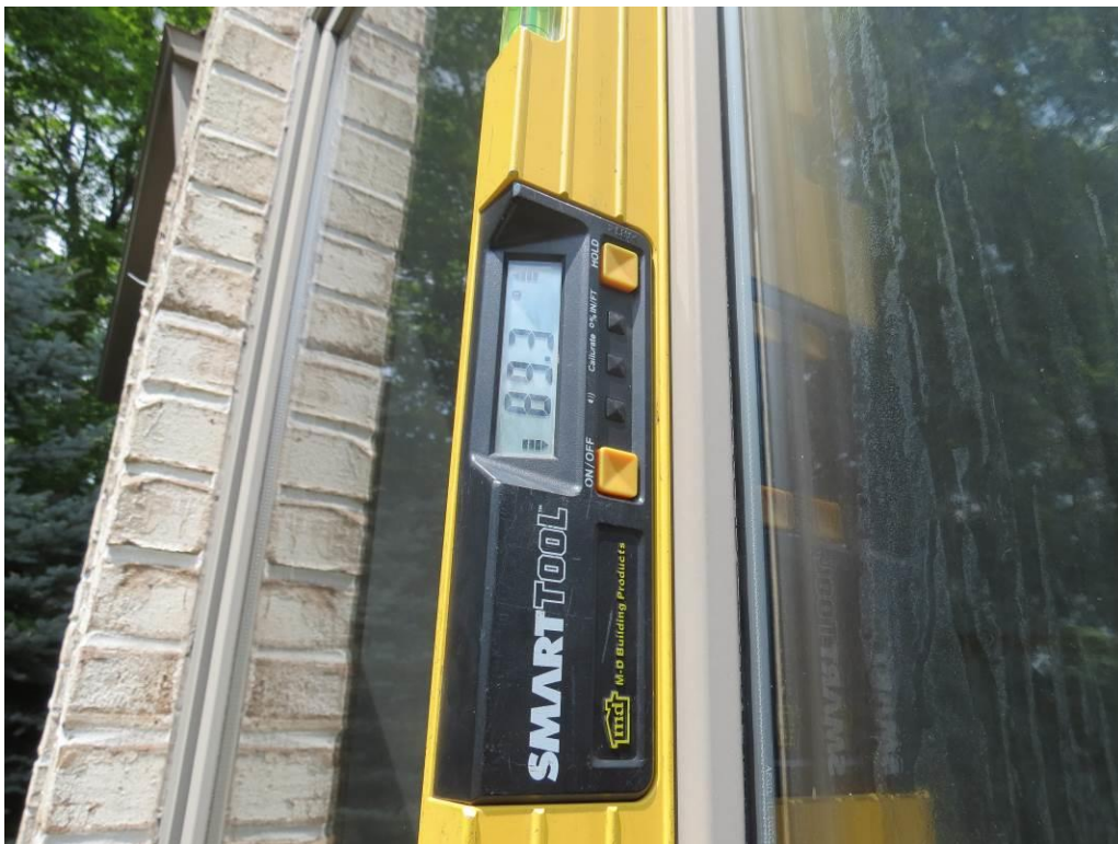
Photograph 4: Window is leaned inward by as much as a measured 0.7 degrees.