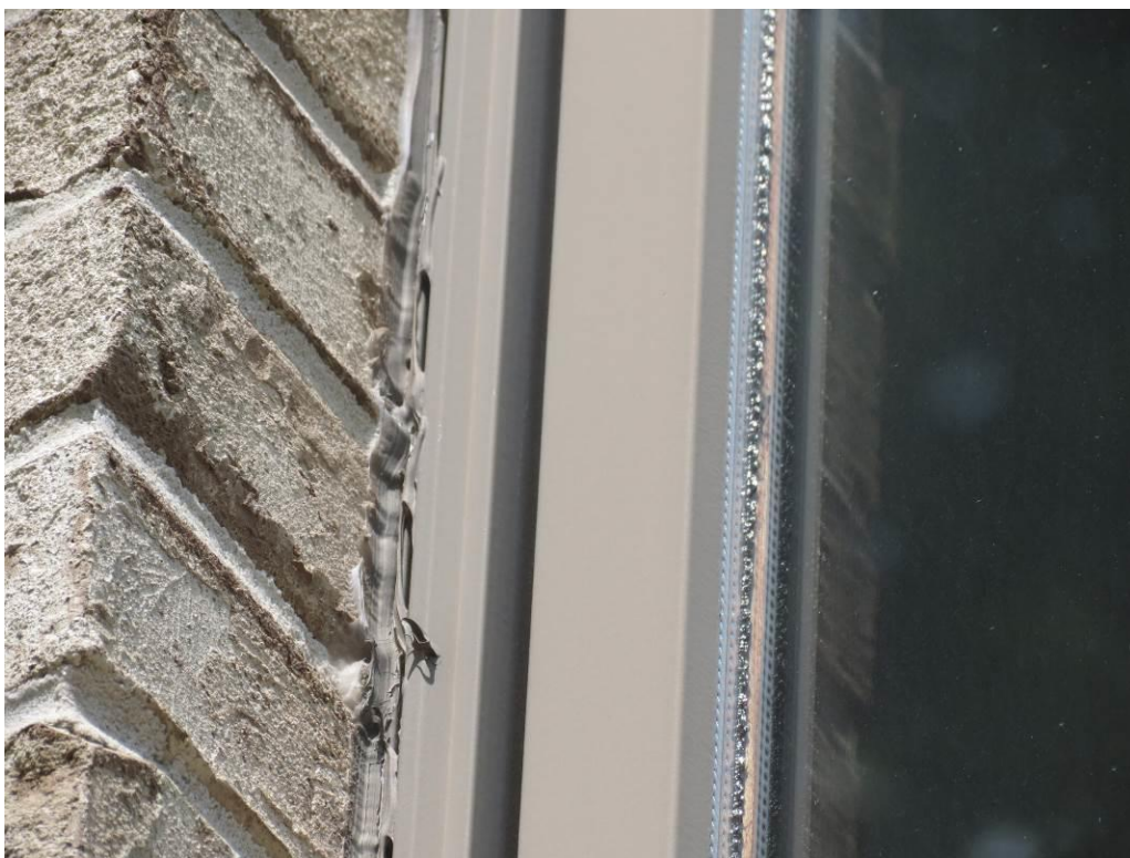
Photograph 6: No apparent separation between window frame and brick veneer. No tears in caulk.