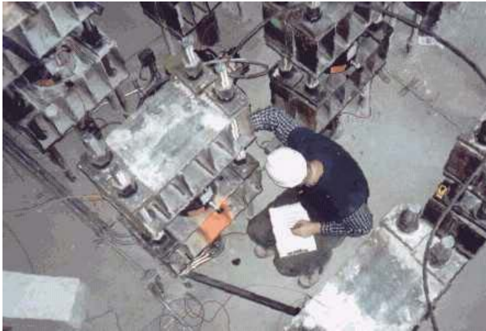
Overhead View of Pile Attachment Frames

To accommodate this forest of attachments, a sub-basement was created below a new steel framed deck and floor at the lower entrance/baggage level of the hotel. All the utilities were restored and snaked through the new sub-basement.