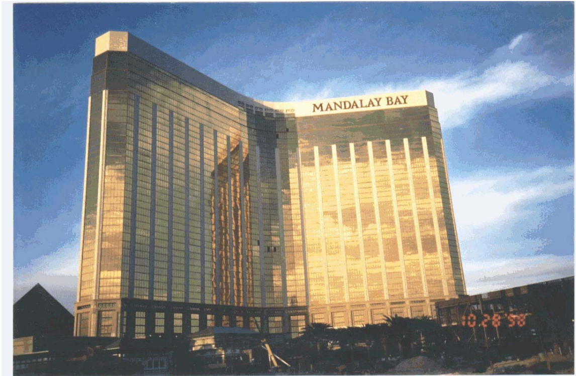
Overall Elevation View of the Mandalay Bay Resort Hotel in the Fall of 1998