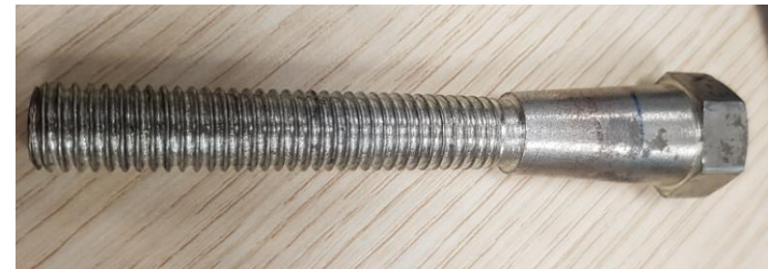
Taper Pin Male Screw Thread