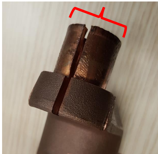
LUG Diameter: 21.5 mm