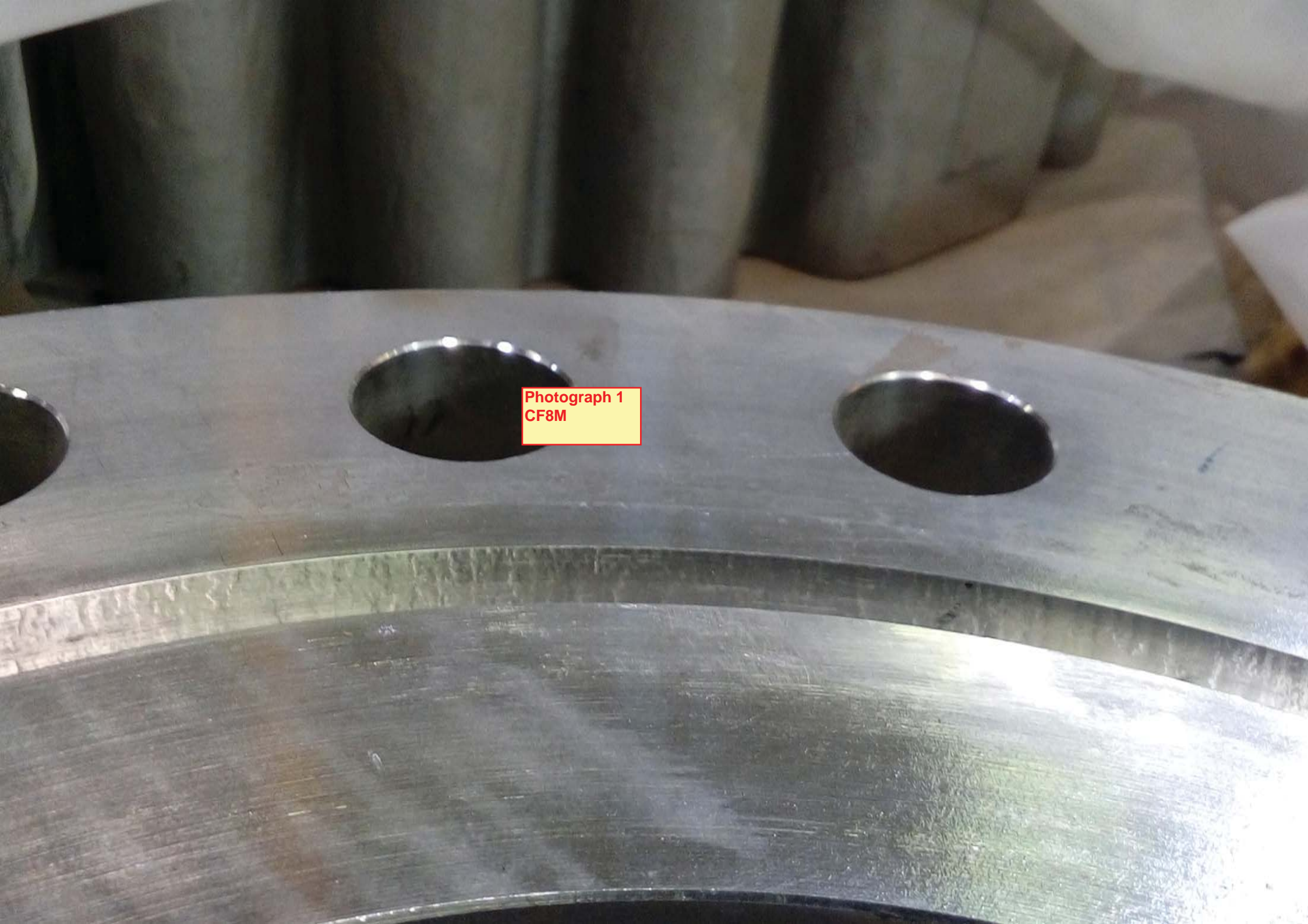
Photograph 1 CF8M