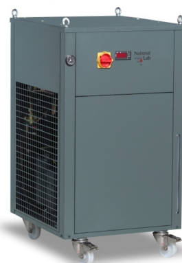
FlowCool Unicus (with option castors)