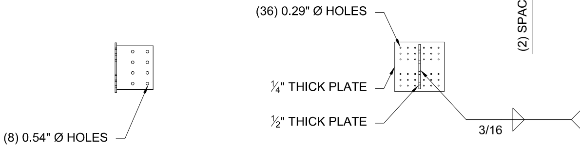
STEEL KNIFE PLATE DETAILS