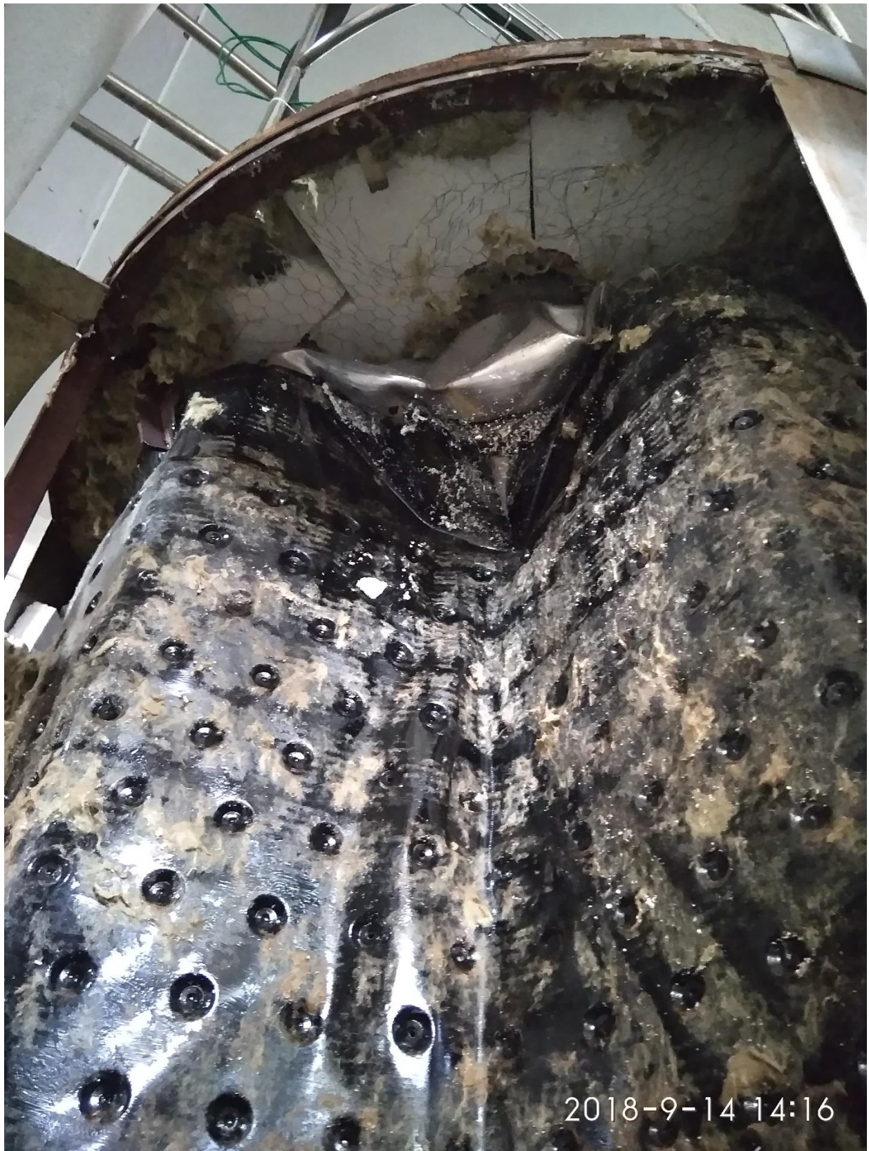
Damage taken place at Air vent Area