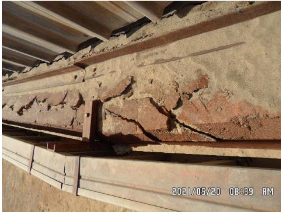
Cracked Concrete Ring