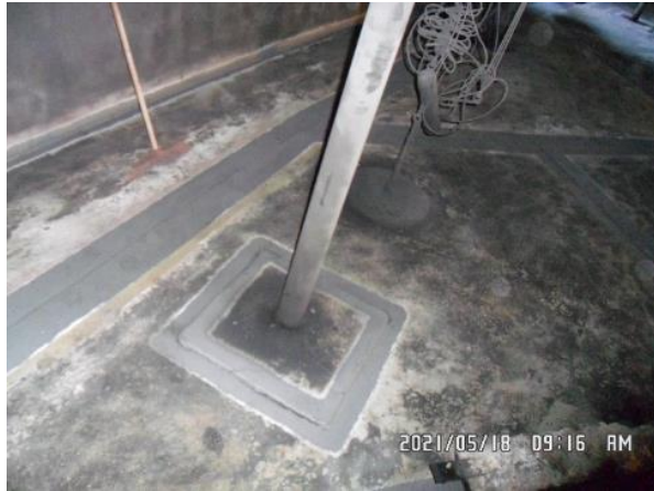
Legs' bottom plates checked with 100% MPI (Acceptable)