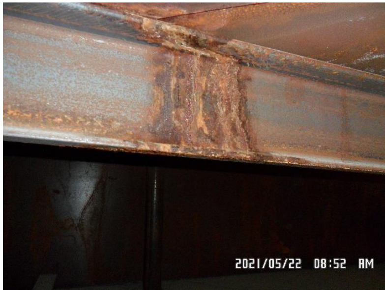
Roof Plate inside the Deck through Sample Port