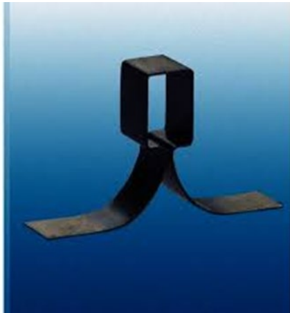
Figure 1 – Uplift Prevention Clips Details

panels shall have a minimum of 1/4-inch (6.3 mm) edge support when installed using either a standard 1 inch (25.4 mm) or a slim line 9/16 inch (14.3 mm) width T-bar grid framing as shown in Figure 2 of this report. The panels shall be installed in the framing members of suspended ceiling systems without the use of restraining clips that would impede or affect their downward movement. Uplift prevention clips are permitted but not required. Figure 1 of this report provides a detail of the clip.