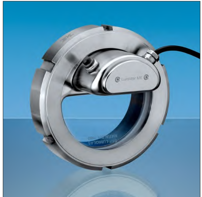
Lumistar luminaire ME-LED, installed in a screwed sight glass unit similar to DIN 11 851