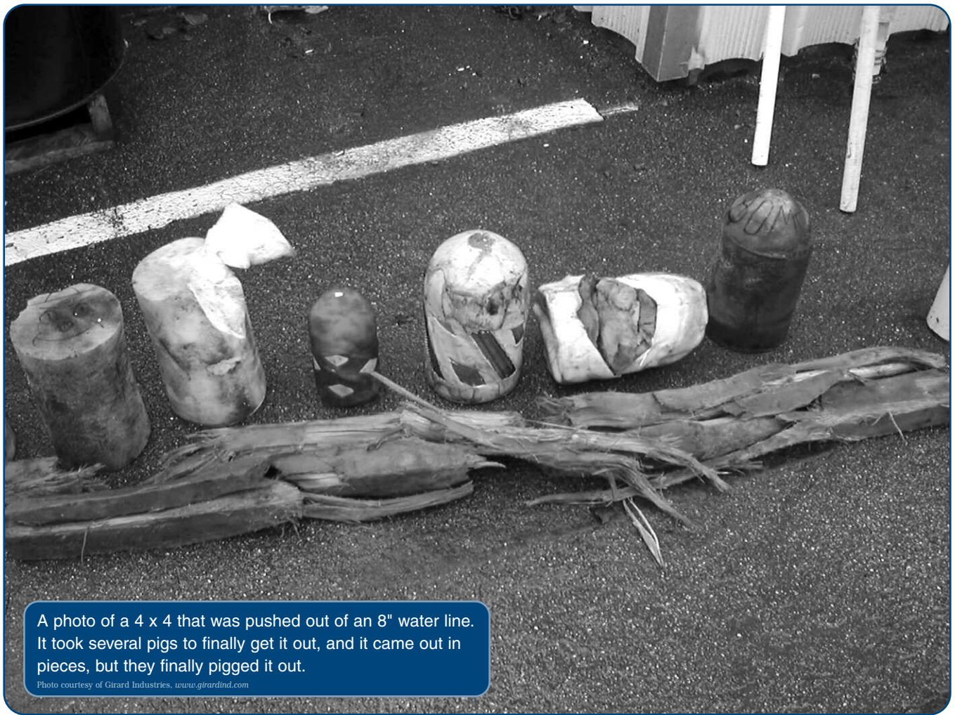
A photo of a 4 x 4 that was pushed out of an 8" water line. It took several pigs to finally get it out, and it came out in pieces, but they finally pigged it out.