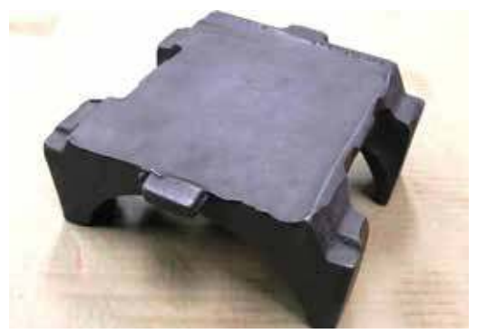
Adapter with excessive wear

Adapters suitable for further service that have been used in frames with roof liners should always be used in frames with roof liners in the future.