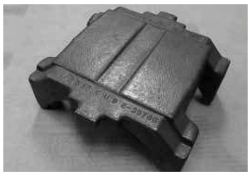
Standard freight car narrow adapter

When adapters become worn, they do not distribute the load to the bearing properly. Excessively worn adapters may result in premature bearing damage and reduce bearing life.