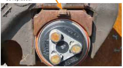
Acceptable adapter: relief is not in contact with the roof liner

6. Check the adapter for excessive crown wear. If the frame or roof liner (if equipped) makes contact with the relief portion of the adapter, the adapter must be replaced.