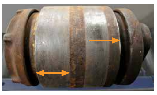
Excessive wear bands

5. Wear bands that extend to the end of the outer ring, as shown on the left side of the image below, indicate an excessively worn adapter seat. A shiny edge at the extreme end of the outer ring, as shown on the right side of the image below, is an indication that the thrust shoulder is worn. Replace the adapter if either of these conditions exist.