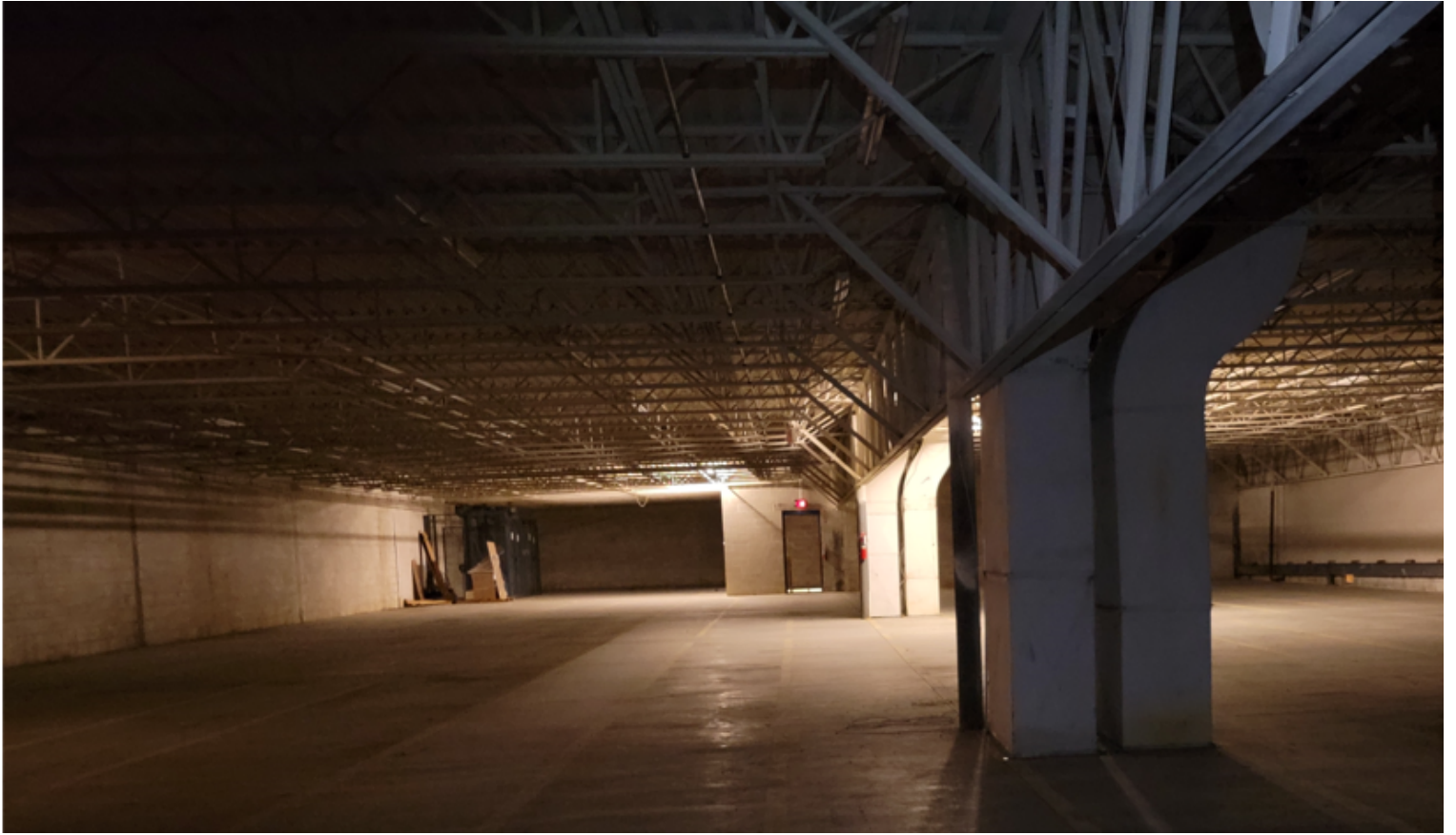
DETAIL 2: MEZZANINE