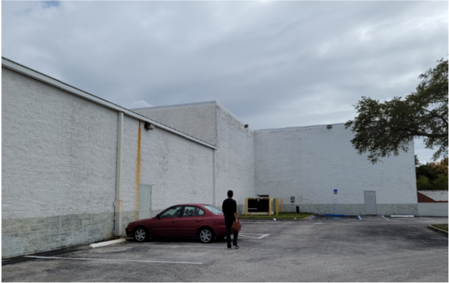
DETAIL 4: OUTSIDE VIEW OF (E) BUILDING